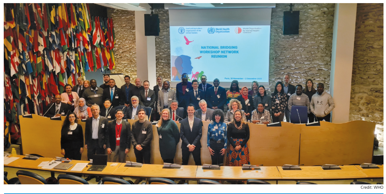
Figure 9: Members of the NBW network present at the NBW Reunion in Paris, France (December 2022)

The NBW Programme is implemented by a vast network constituted of representatives from all over the world from the three organizations (WHO, FAO and WOAH) at the three levels (Headquarters, Regional and National). Authors would like to thank all the contributors involved in this program for their daily efforts in supporting countries in the operationalization of the One Health approach.