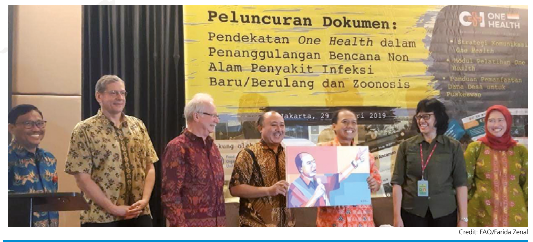
Figure 5: Launching Government Regulations for zoonotic emergency response, in Jakarta.