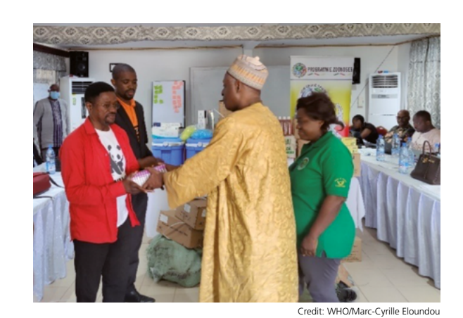
Figure 3: Handing over of the laboratory equipment to the WWF Campo Wildlab manager after the mpox simulation exercise.